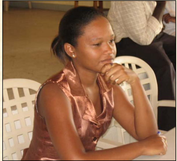
Participant in Leadership Workshop, 2 June 2010