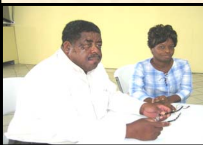
Officials of the National HIV/AIDS Directorate at the Workshop

The topic, "Linkage between Drugs and HIV/AIDS", was one of the issues presented at the first of a series of one-day workshops convened by the Royal Grenada Police Force, for its Officers. The presentation was done by the Drug Control Secretariat as part of its on-going campaign in collaboration with the National HIV/AIDS Directorate. The workshop was held 18 April 2007.