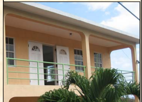
Present site of Carlton House Treatment Centre

new facility, including new services to be provided at the facility. In 2005 an evaluation of all drug treatment and rehabilitation services provided in Grenada was conducted. It is expected that these findings would inform such new services.